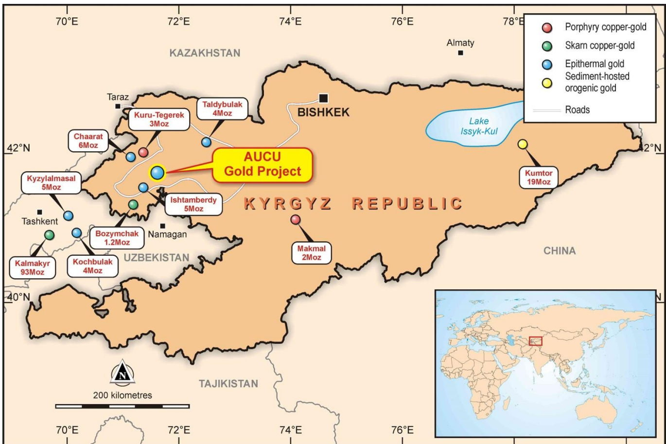
Location Map: Northwest Kyrgyz Republic, Central Asia