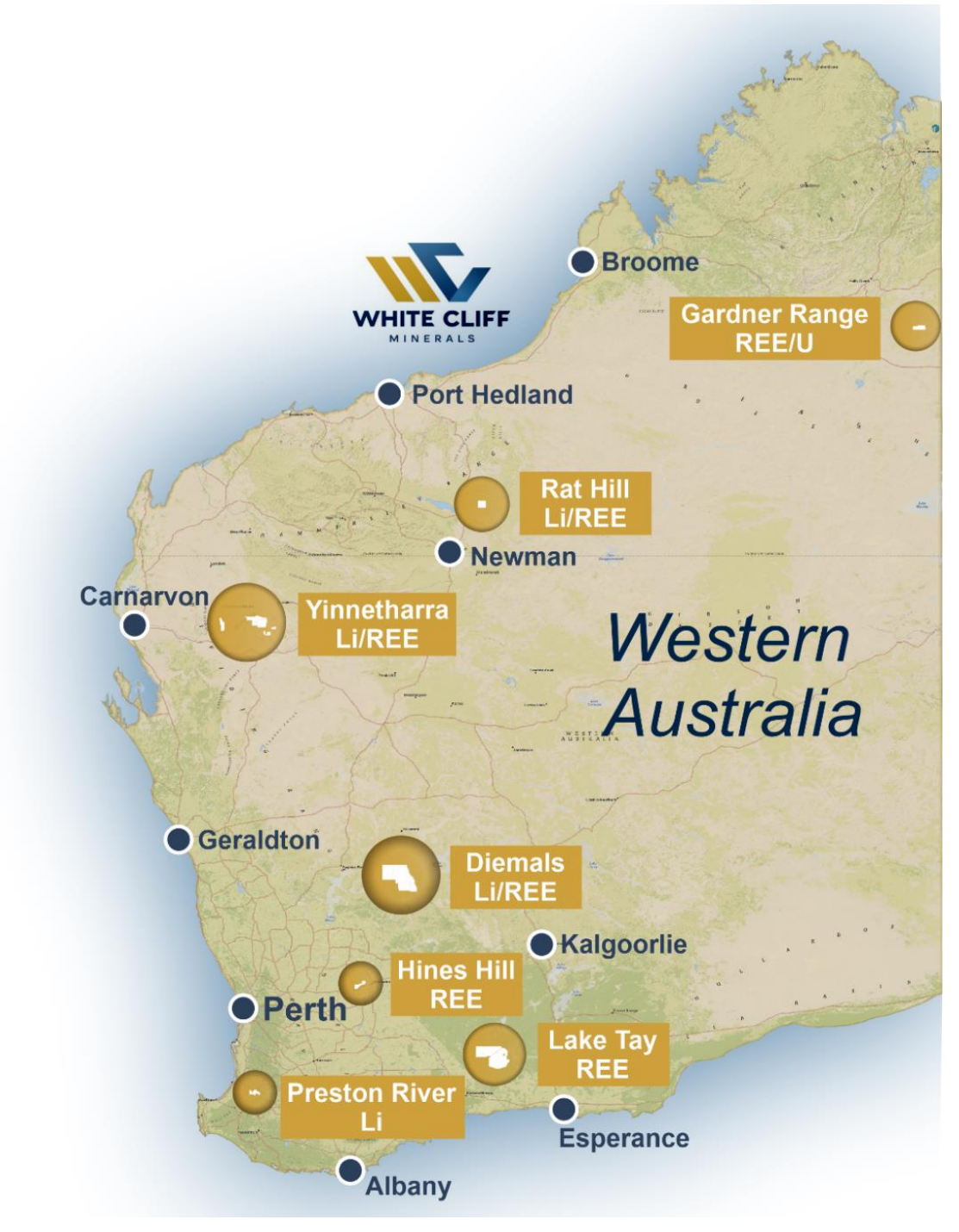
Figure 1: White Cliff REE & Lithium tenement locations

Table 1 shows the results from the 13 expedited samples, from 118 samples collected from a first pass reconnaissance site visit, and expressed as oxides in parts per million (ppm), with examples of the rock types and alteration. The site trip was not comprehensive and a high resolution magnetic and radiometric survey is planned to be completed before further field trips are undertaken.