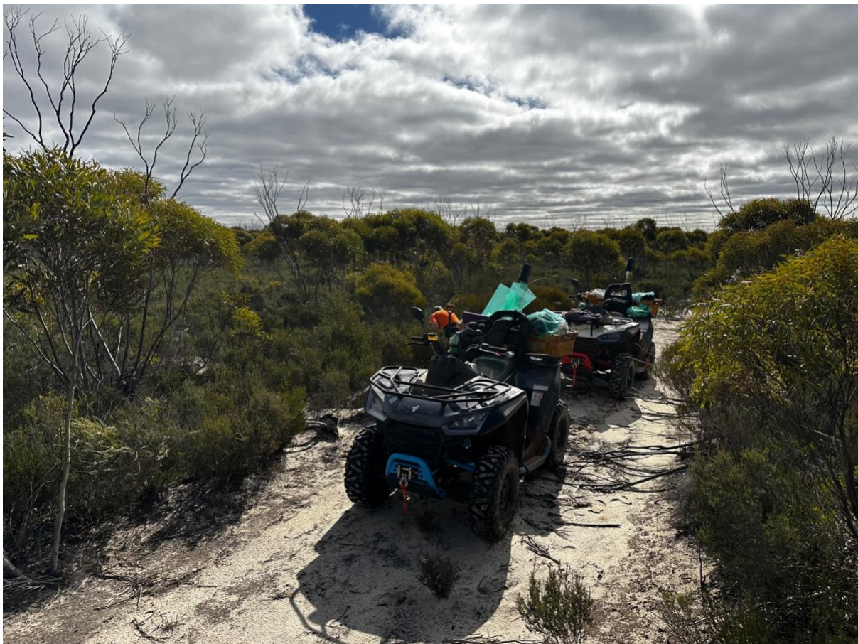
Figure 2 REE sampling programme at Lake Johnston

Whilst the Company will continue to engage with interested parties regarding possible collaboration, investment or other transaction type on the Project it will look to undertake follow up exploration work as a matter of course and will update the market accordingly.